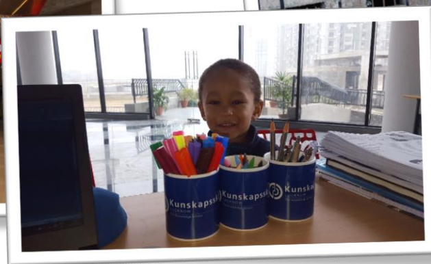
Created by: Linus Gellerstedt